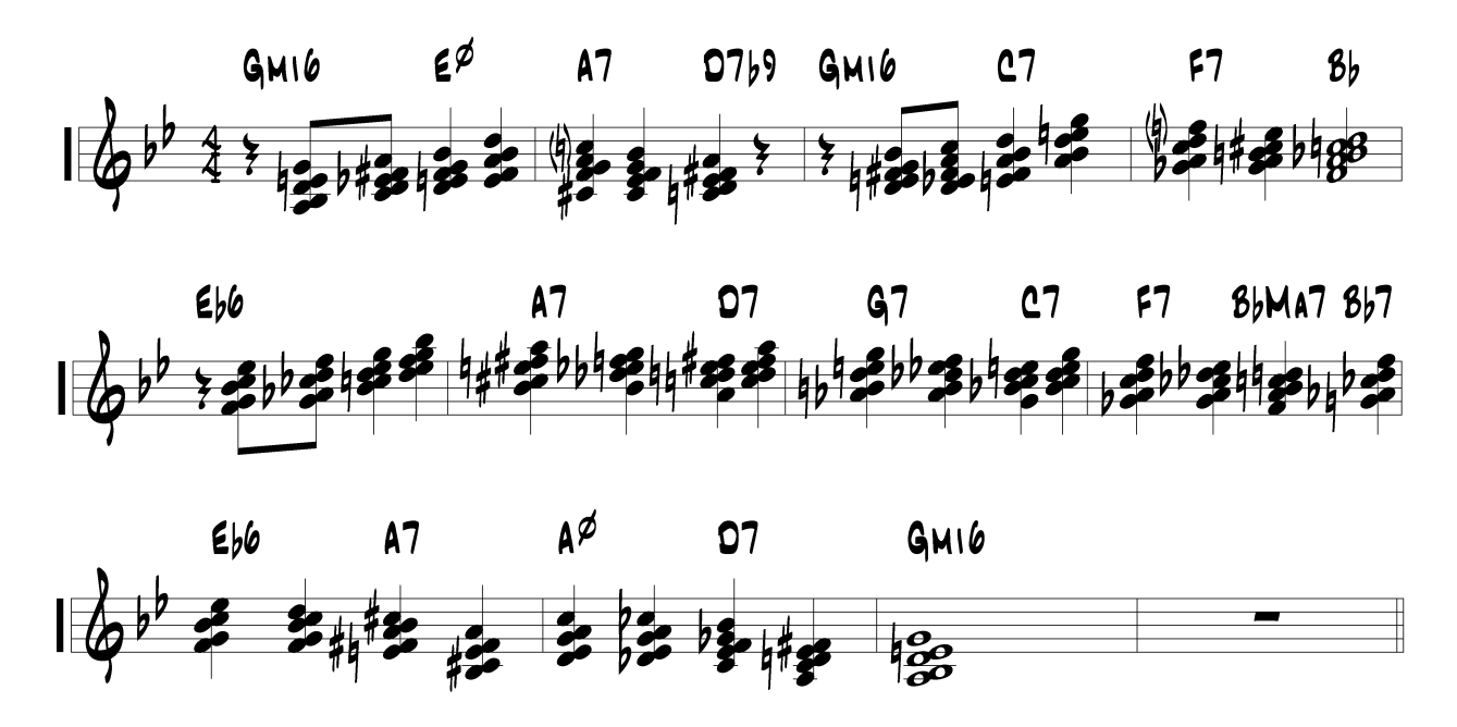
Ex. 10: Close Enough for Love (Measures 1-12)

The style of using clusters is appropriate for both solo and rhythm section piano. Any cluster arrangement of a head can also be played by the pianist as part of the rhythm section. Simply play the melody in the left hand, one octave below the melody in the right. Clusters can also be used as left hand chord voicings. Practice examples 1 and 2 (above) in the left hand as a way to begin to develop the technique.