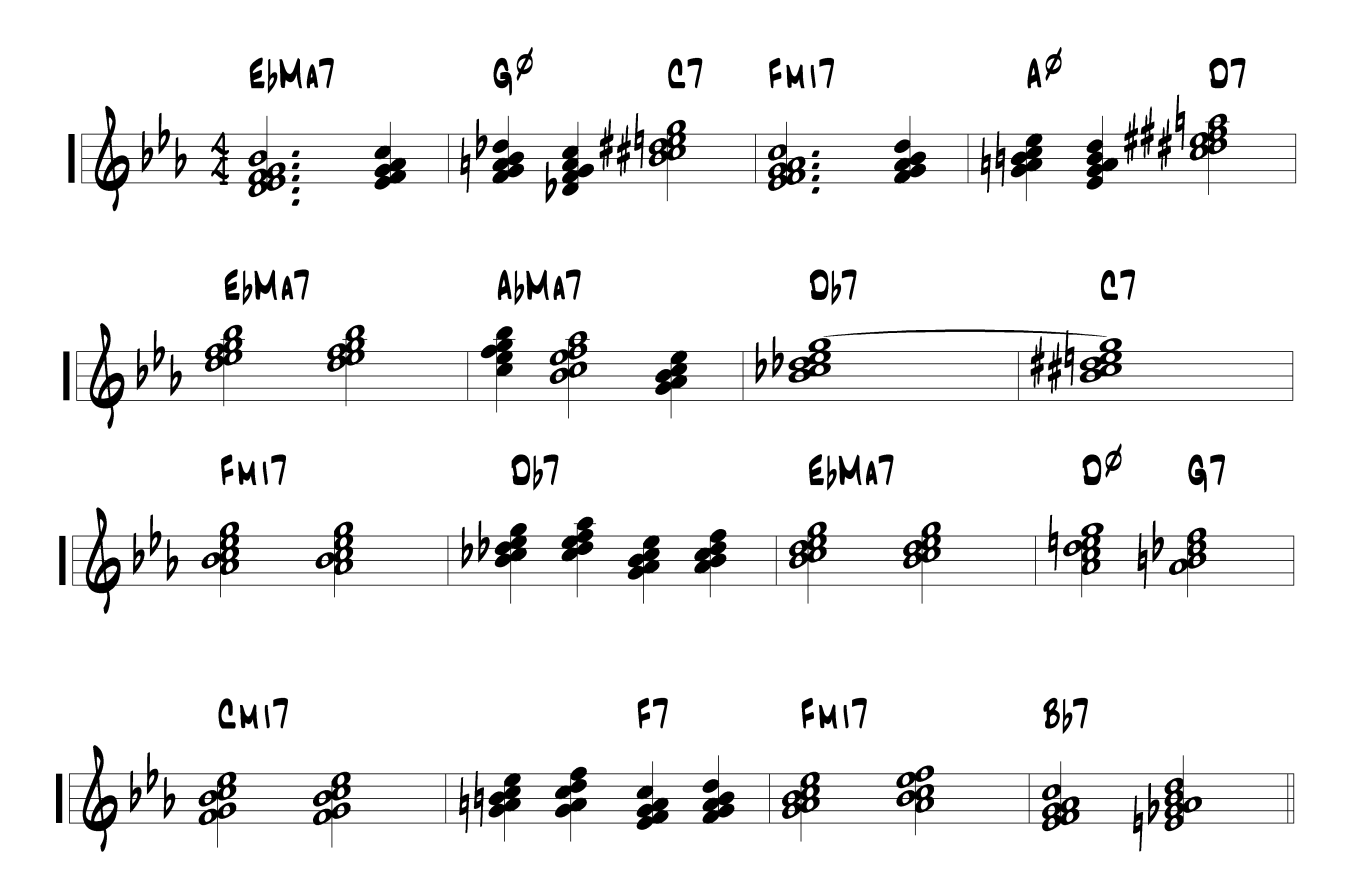
Ex. 6: It Could Happen to You (Measures 1-16)

In this harmonization, most of the clusters are from the scale of Eb major (measures 1, 3, 5-6, 9, 11, 13, and 15) or an appropriate melodic minor scale. In measure 2, G half-diminished is harmonized with the sixth mode (G locrian #2) of the melodic minor (in this case the Bb melodic minor scale). The C7 uses a cluster voicing of C7b9#9. Measure 4 is the same as measure 2, but up a whole-step. Notice also the use of the fourth mode of the Ab melodic minor scale for Db7, producing the Db lydian-dominant scale. Notice, finally, in measure 16 how Bb7 is harmonized with Bb13sus4 to Bb7 #5#11. Play through the example and analyze the clusters in the arrangement.