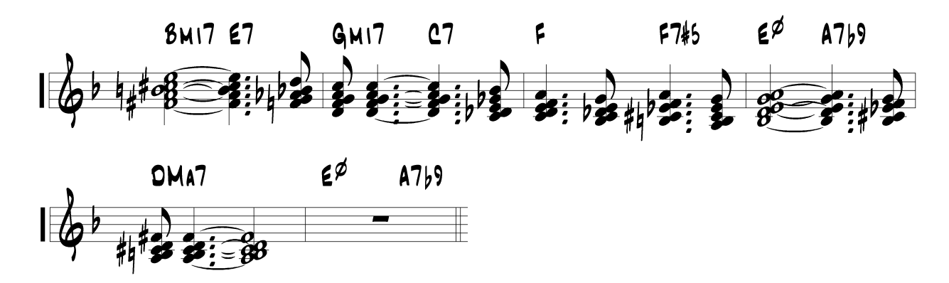
Ex. 7: Alone Together (Measures 1-14)

In "Alone Together" (Example 7), most of the chord clusters are straightforward expressions of the chord adjusted to accommodate the melody. One harmonization technique that can be seen in measure 3 of this example is the tonic chord alternating with the diminished seventh chord functioning as a leading-tone chord to the tonic. This technique—often referred to as "Shearing Style," is often appropriate given that the harmonization takes every note of the melody into account—both the notes in the chord, and the non-chord passing tones. In harmonizing major or minor chords in Shearing style, the tonic chord clusters alternate with the leading-tone diminished seventh chord. Example 8 shows C6/9, while example9 shows Cmin6/9: